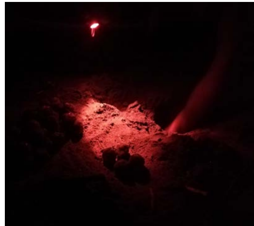
Egg collection on closed “veda” nights at Barra de Santiago beach and El Tamarindo beach