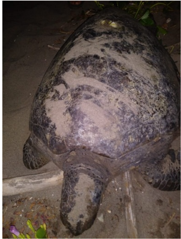
Incubation of 70 green turtle eggs in El Tamarindo