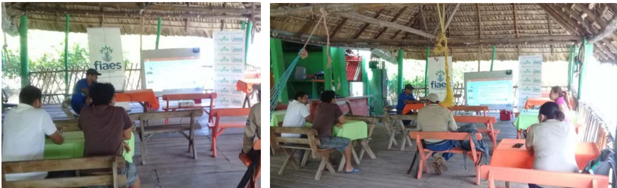
Trash receptacles planning meeting, September 9, 2020

A preliminary meeting was held to identify different factors regarding the construction of two trash receptacles to place in the community of Barra de Santiago. It was decided to find a local person to develop the structures and strategic sites were proposed for the installation, with good visibility, use and design in mind. The opinions of the Ministry of the Environment and local community organizations were considered. For the elaboration of these receptacles, only one person presented a proposal but he has experience working on other beaches. He built a turtle shaped and a fish shaped receptacle, to have variety and become a better tourist attraction. Strategic placement was chosen in areas with a high influx of tourists, which can also be monitored and managed by AMBAS. A sign has been placed on these structures specifying what is allowed. The plastic trash that is collected in these containers is delivered to a plastic buyer or delivered to the garbage collection service for final disposal in a landfill.