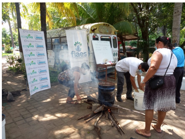
Bordeaux mixtures training, November 10, 2020