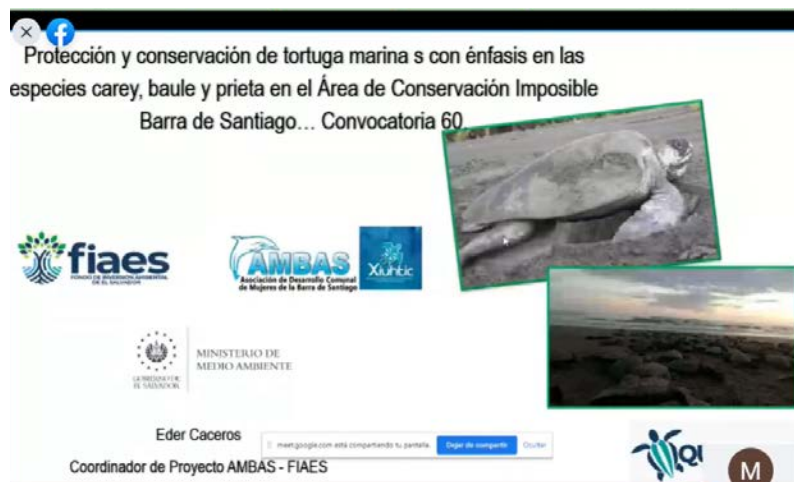
Inauguration event announcement, July 29, 2020

https://www.facebook.com/fiaes.sv/videos/208372257265784/