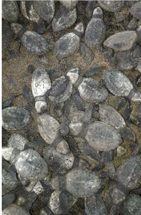
Birth and release of 110 hatchlings of green turtles in Barra de Santiago