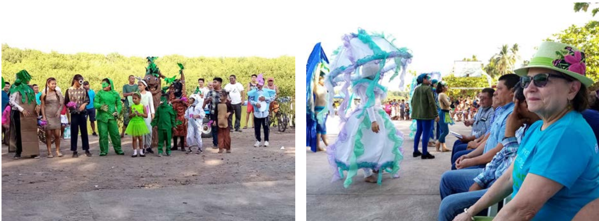
2019/2020 sea turtle nesting season closing event and celebration of World Wetlands Day, February 2020

For this celebration we joined forces with IUCN to organize a fairly large event. Each of the participating institutions contributed something to develop the activity. In the case of AMBAS, we merged it with the project closure event. There was the participation of a national and community artistic cast where the schools offered their support. This event was published on social networks and on a local television channel