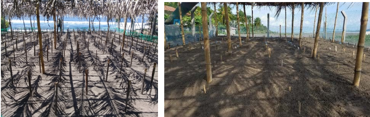
Hatcheries in El Tamarindo and Costa Azul with incubating sea turtle eggs