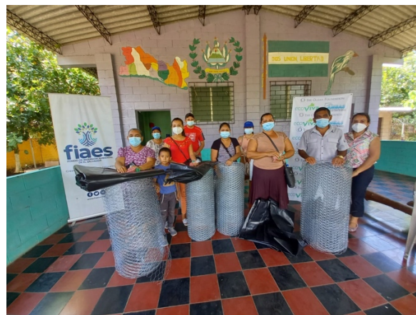
Training in soil microorganisms preparation and delivery of supplies to beneficiaries, November 27, 2020