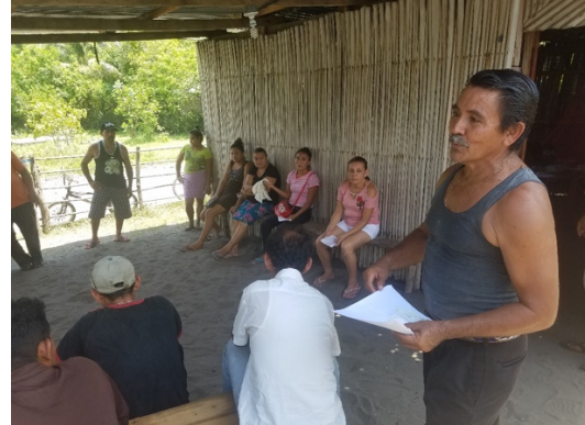
Huts in Barra de Santiago and El Tamarindo, July 2020