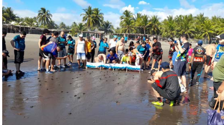
Public hatchling release, November 20, 2020