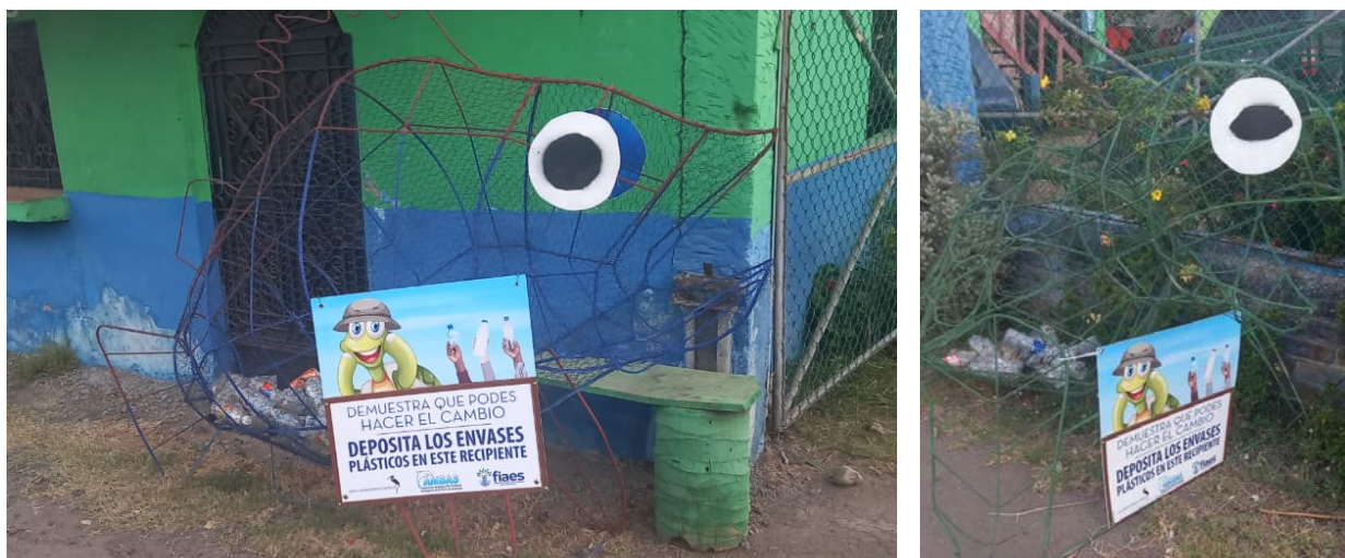
Placement of plastic trash receptacles in the community of Barra de Santiago