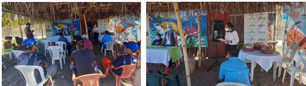
Sea turtle nesting season closing event

A small closing event was held due to the pandemic restrictions. Visitors learned about the different activities that were carried out, the different processes and goals met during the execution of the project, and the projections for next year and beyond.