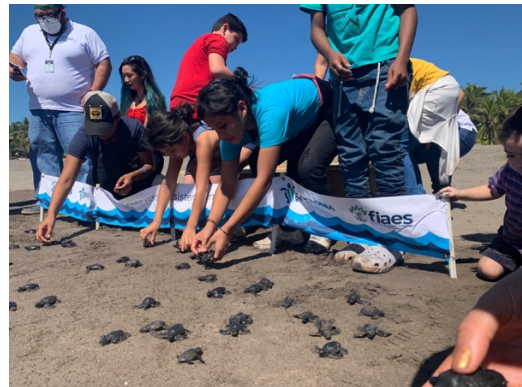
Public hatchling release and mangrove planting day with Red Mundo Vida, November 24, 2020