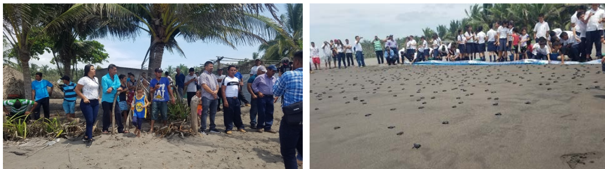
Public sea turtle hatchling release event, September 26, 2019

We conducted a hatchling release event with conservation managers from La Reserva and Mundo Vida Youth Network. Approximately 30 people attended and were also invited to carry out mangrove restoration activities. They learned about techniques for transplantation and seed dispersal, removal of weeds from the white mangrove nursery quadrants, etc. In total they transplanted 60 white mangrove trees. Later, they went to the sea turtle hatchery and learned about the initiative, and then carried out the sea turtle hatchling release.