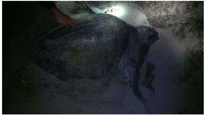
Incubation of 112 green turtle eggs in Barra de Santiago