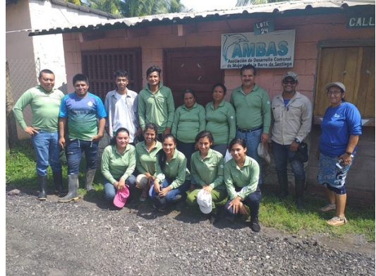
Sea turtle hatchling release event with managers and youth network of the Apaneca Biosphere Reserve - Ilamatepec, September 27, 2019