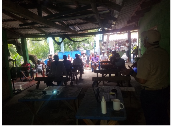
Hatchery management trainings, September 14-16, 2020