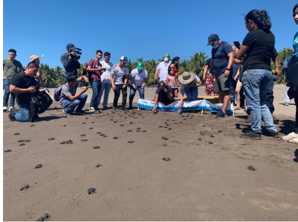
Public hatchling release, November 5, 2020