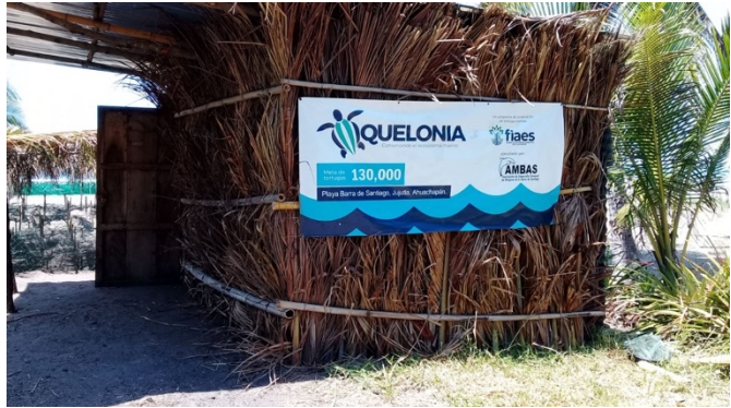
Building of the Barra de Santiago hatchery, July 18, 2019

Building of the El Tamarindo hatchery: since this hatchery was not removed the previous season, the interior was rehabilitated. The substrate was prepared with a change of sand, the roof was improved, and we changed the beams made of bamboo and palm, as well as built a canopy outside to welcome the public to the hatchery facilities. The hatchery has dimensions of 18 x 18 meters, having 324 m 2 , and can fit 1,296 nests inside. The hatchery was filled with sand to form a high edge, for protection against strong waves.