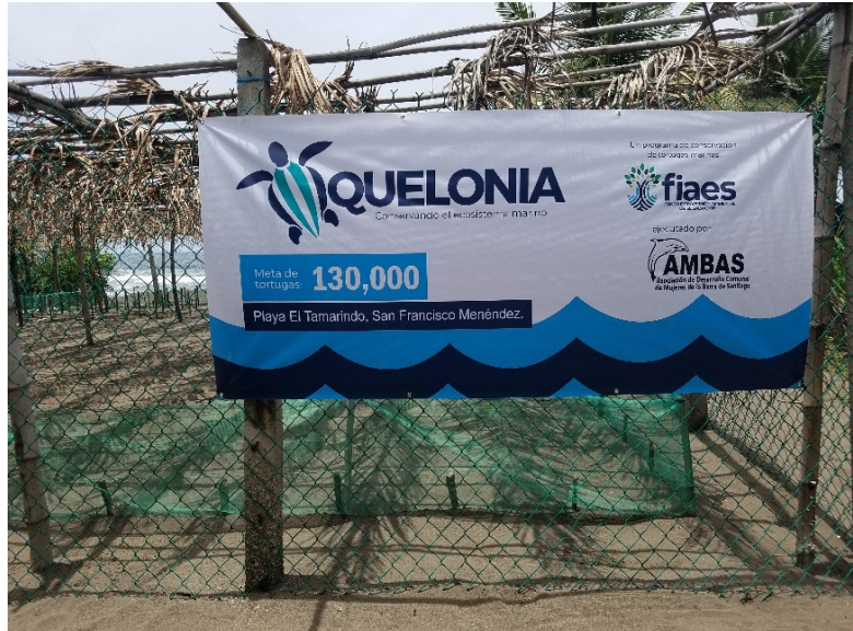
El Tamarindo hatchery construction, July 19, 2019

Building of the Costa Azul hatchery: This hatchery was built completely from scratch. A prior meeting was held with the tortugueros and the local community organization (ADESCO) to identify the optimal site. Finding the ideal place, the hatchery was built. The dimensions are 14 x 15 meters, 210 m 2 , with space for 840 nests inside. The site was completely prepared, the