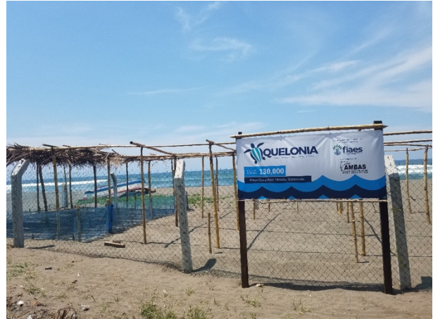
Building of the Costa Azul hatchery, July 31, 2019