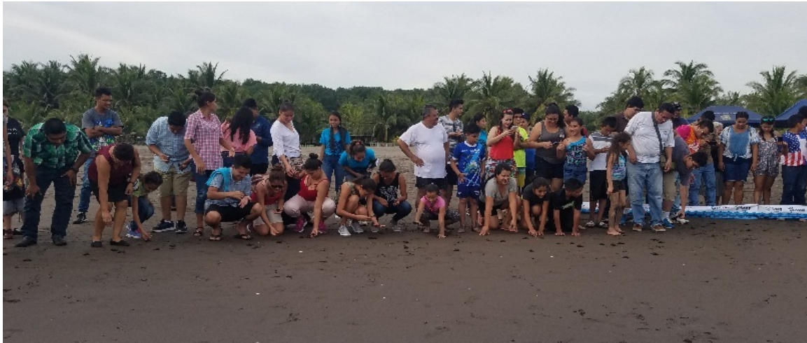
First public sea turtle hatchling release, September 8, 2019

The second public hatchling release event was carried out in Playa El Tamarindo in which there was the collaboration of the San Francisco Menendez mayor's office and the Cara Sucia County school. Students, community and people interested in hatchling releases were present. The objective was to raise awareness among people and students not to consume turtle eggs due to human health and for the conservation of the species. This event was also broadcast by local and national media.