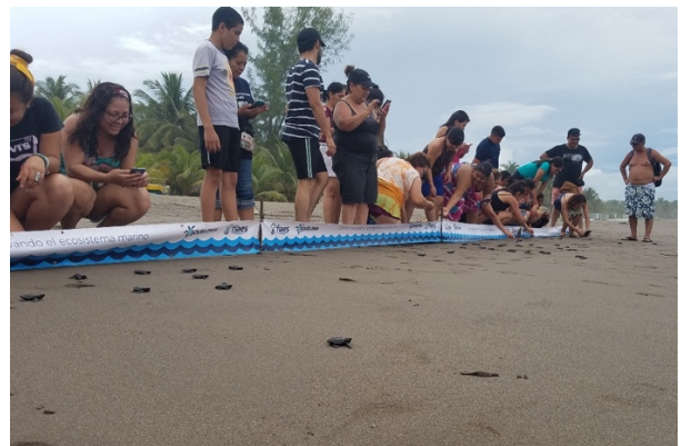
Public hatchling release with tour group, December 27, 2020