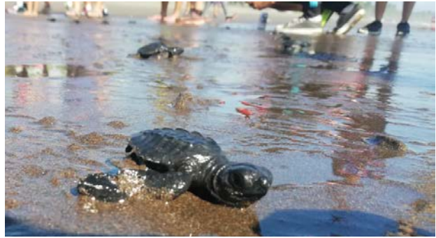
Public hatchling release with tour group, November 25, 2020