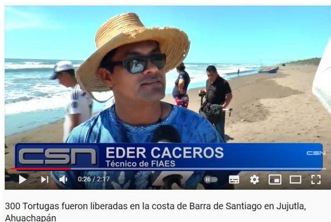
News coverage of sea turtle conservation activities