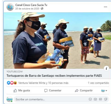
News coverage of event where raincoats and flashlights were delivered to tortueros, October 20, 2020