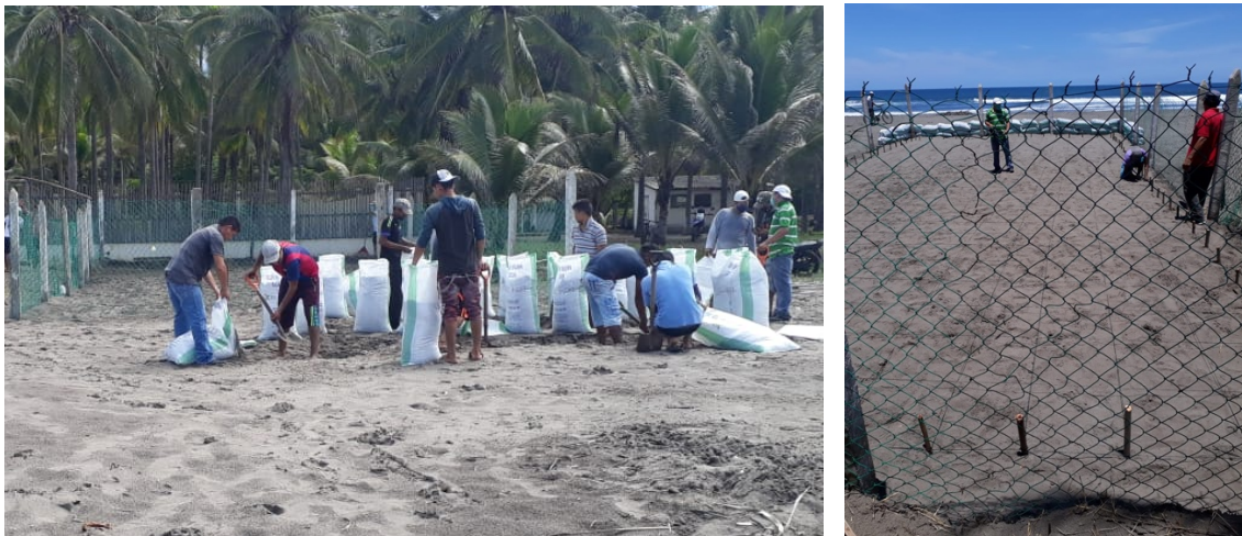
Preparation of the Barra de Santiago hatchery, July 2020

Construction of a sea turtle hatchery in Playa Barra de Santiago: The Barra de Santiago hatchery was prepared, sand was removed to heat the substrate and cleaning of some patches. The bamboo of the roof was changed, palms were erected, and the sand was divided into squares to mark the placement of each nest.