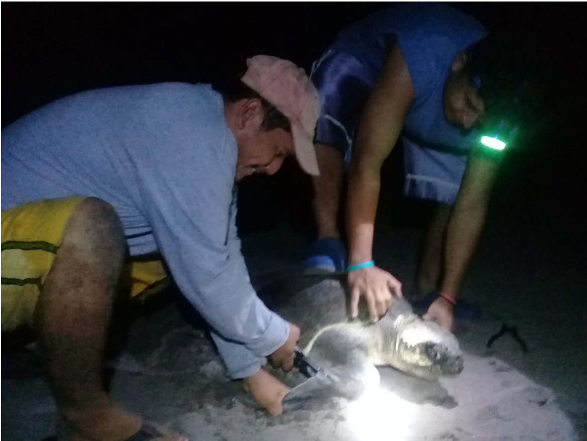
Trainings and tagging of nesting sea turtles, September 24, 2020