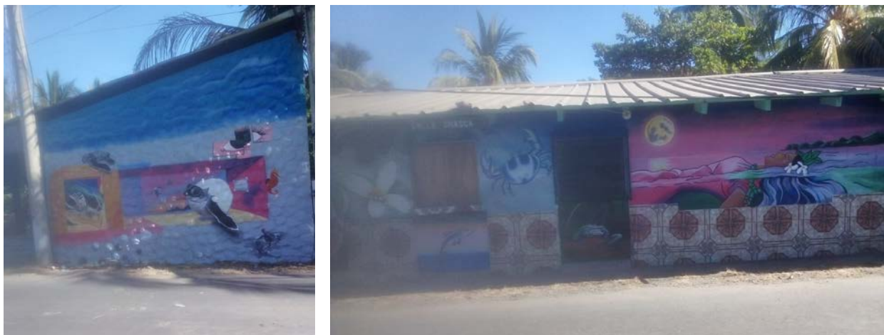
Mural about marine conservation, December 23, 2020