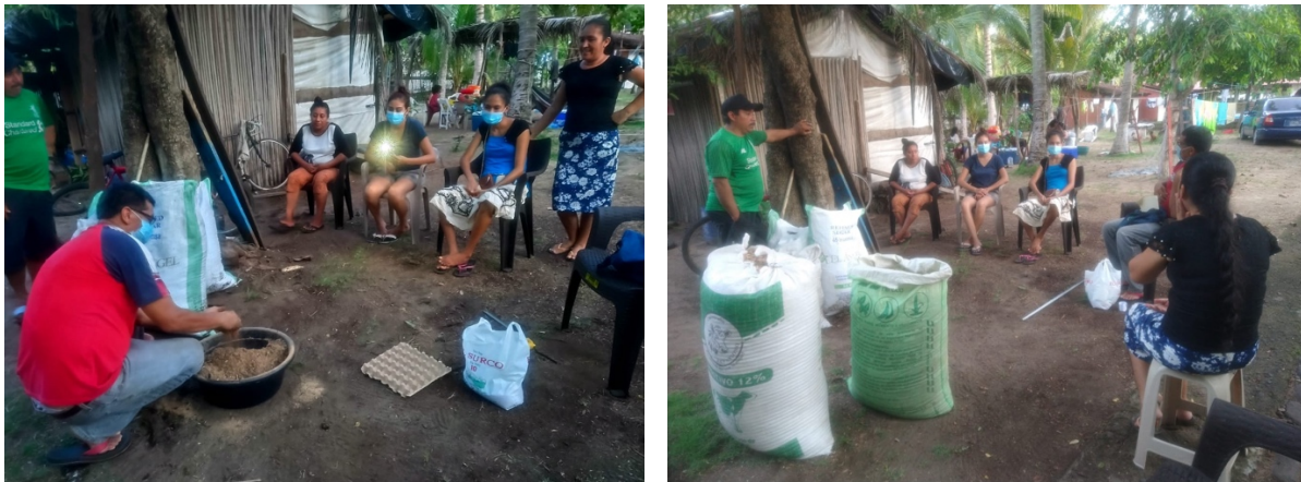
Substrate preparation training, October 16, 2020