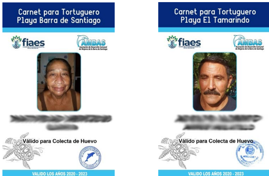
Figure: Design of credentials for tortugueros

In light of the problem of illegal egg consumption and the mistreatment of turtles through the poaching of their eggs, the relevant authorities make regular patrols of the beaches at night. Due to this, credentials were designed and elaborated that accredit our collaborators as official egg collectors and that they are working based on the guidelines established by the Ministry of the Environment. We handed out a total of 200 credentials for the tortugueros.