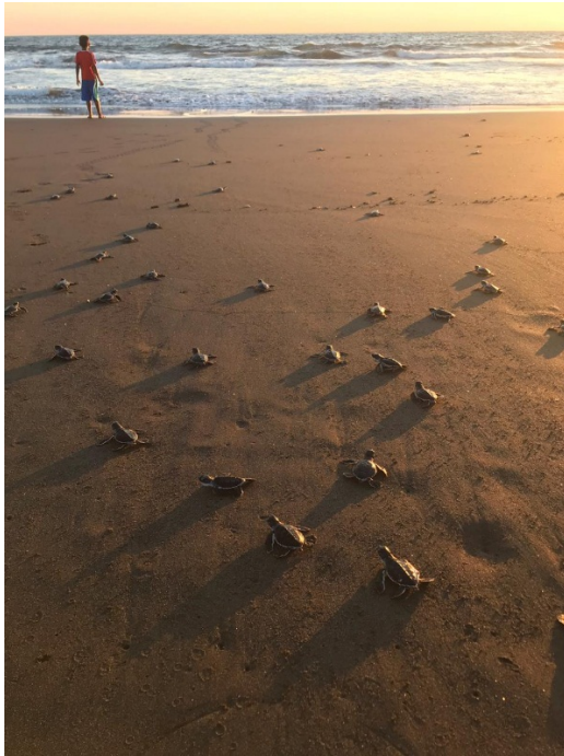
Birth and release of 70 hatchlings of green turtles in El Tamarindo