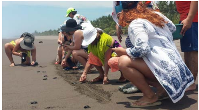
Public hatchling release with tour group, December 2, 2020