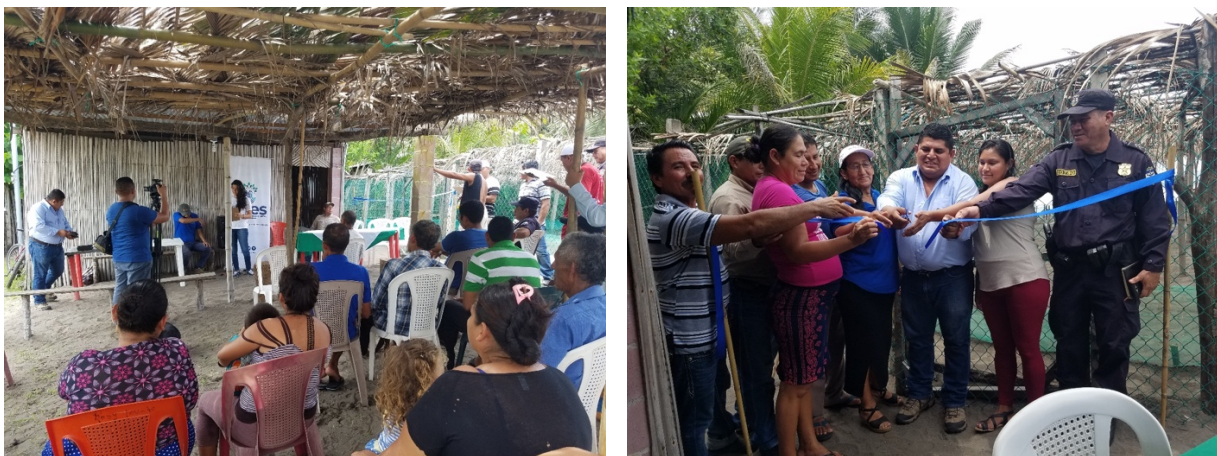
Sea turtle nesting season inauguration event, August 22, 2019

The inauguration event for the 2019/2020 sea turtle nesting season was held in the community of El Tamarindo to give this community the leading role in the event. This was in recognition of their consistent collaboration for the development and success of the project. The National Civil Police was invited and there was participation by FIAES staff who spoke on the guidelines and directives for the execution of the project.