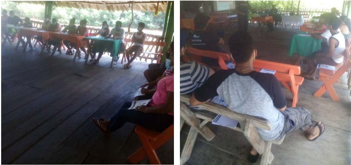
Sea turtle egg collectors from El Tamarindo participate in a first aid training course

turtle hatcher knows a little about prevention and treatment measures for any mishap that may happen when he is patrolling the beach, such as cuts by branches or tree trunks, etc. The day was quite productive. They were not only given theory but also practice. With the use of test apparatus, CPR, forms of treatment were taught to affected people, immobilizations with tourniquets, tables, etc. We worked with the basic first aid manual.