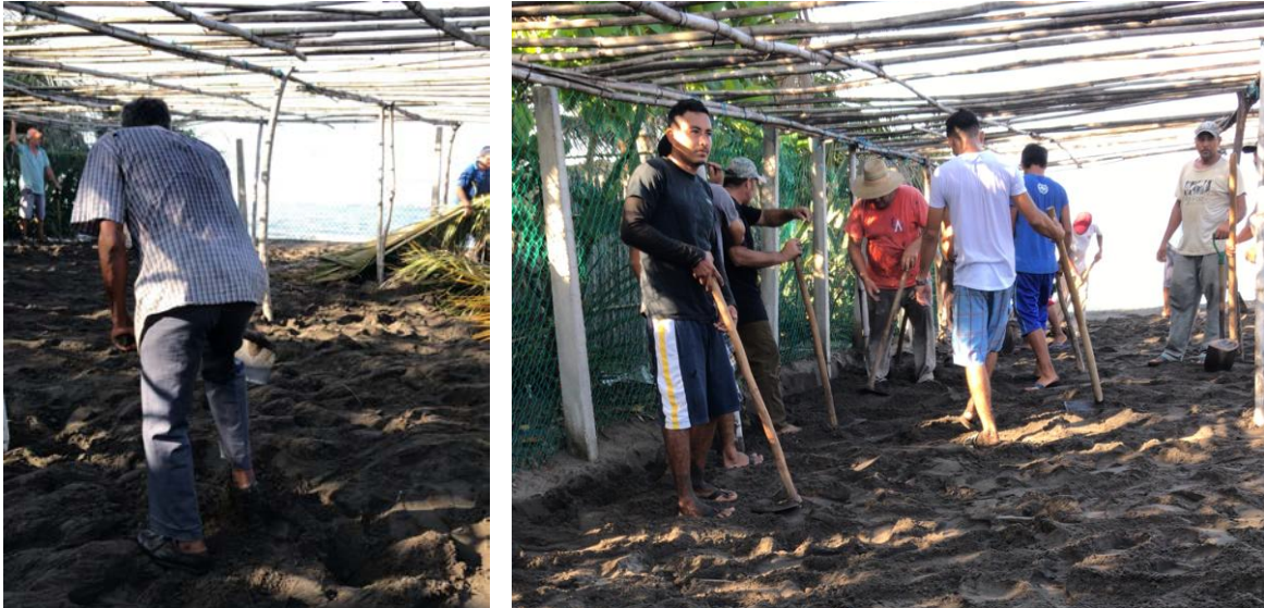
Preparation of the El Tamarindo hatchery, July 2020

on the periphery of the hatchery were strengthened. The bamboo of the roof was changed, palms were erected, and the sand was divided into squares to mark the placement of each nest.