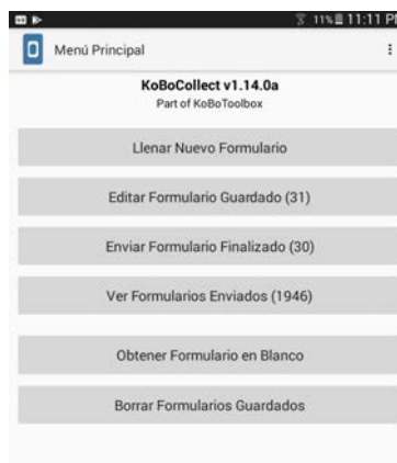
Identification cards given to the tortugueros and screenshot of the KoBoToolbox app for digital collection of sea turtle egg data