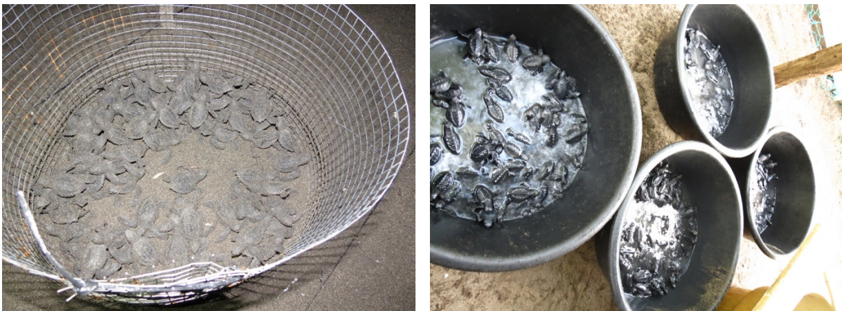
Hatchling sea turtles in Barra de Santiago and El Tamarindo