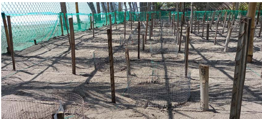
Incubation of olive ridley eggs