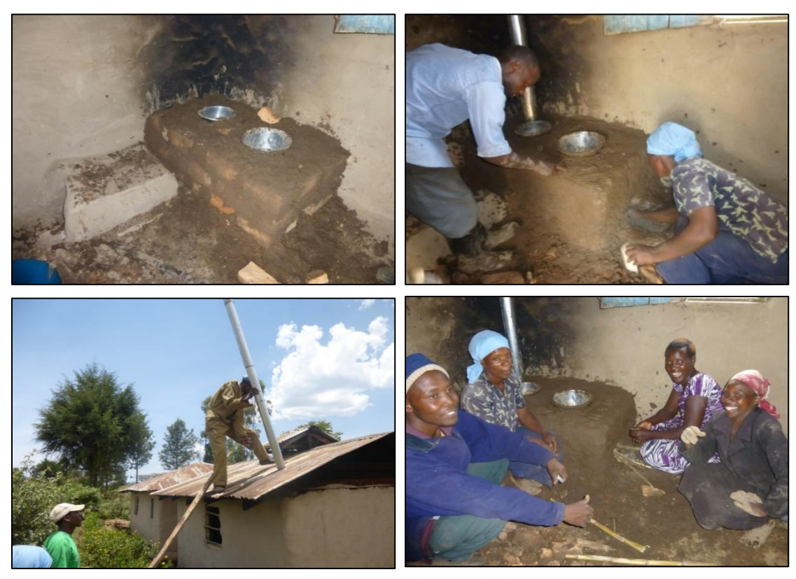
Various stages involved in installing a smokeless stove