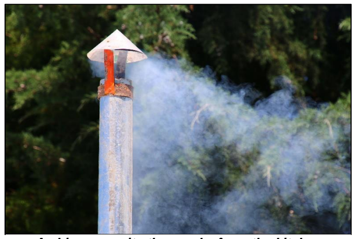
A chimney emits the smoke from the kitchen ensuring a safer healthier environment for all.