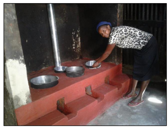
A woman fitting pots in her newly installed smokeless stove

Better health means households save money on medicines and time saved collecting wood gives more time for business activities so income increases & poverty levels reduce. Girls and women need less time to spend collecting wood which frees up their time for school work and income generating activities.