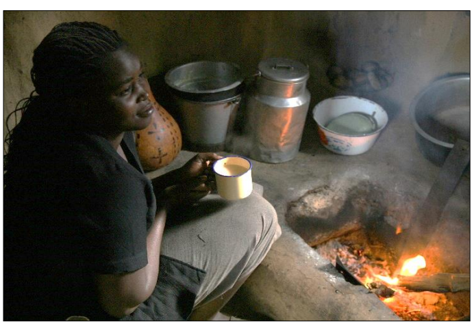
The traditional 3 stove stove – women and children are at risk of burns.

A smoke free cooking environment is a key element of Healthy Homestead and to accelerate this in the community, Brighter Communities Worldwide in partnership with the Ministry of Health train Community Health Volunteers in smokeless stove installation. The installation of a smokeless stove which includes a chimney used to extract smoke from the cooking area. The effects of this programme are seen immediately after installation; the now smoke free environment leads to lower levels of