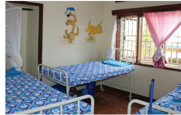
Comfortable Accommodation We provide accommodation for child & caregivers