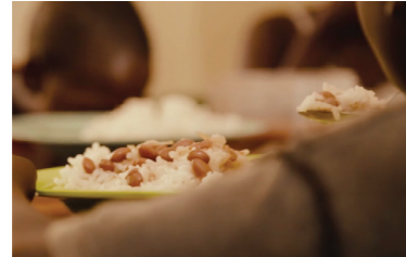
Nutritious Meals We provide 3 nutritious meals everyday.