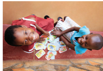
A secure and safe home environment

Spiritual support Child Protection Legal services