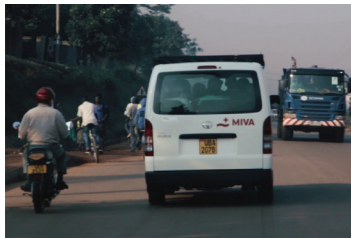
Transport to & from the hospital for treatment.