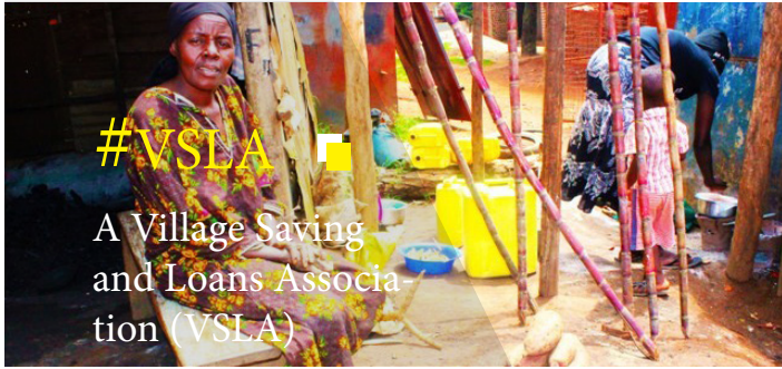
#VSLA A Village Saving and Loans Association (VSLA)

A HCM started a VSLA comprised of local women at Lukwanga parish, to facilitate improvement of their income, so that they are able to support their children.