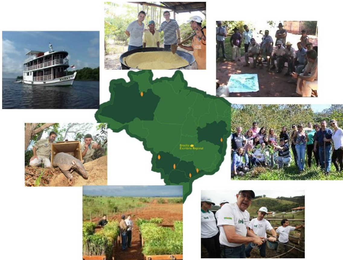
Figure 1: Sites of completed and on-going IPÊ's projects in Brazil.

the Black Lion Tamarin Project, trying to save this species from extinction in the Western region of São Paulo state. Today the institution has more than 90 professionals responsible for about 40 projects spread across Brazil: Nazaré Paulista and Pontal do Paranapanema in São Paulo (target biome: Inland Atlantic Forest); Pantanal in Mato Grosso do Sul; and in the Lower Negro River in Amazonas and several Amazonian Parks (target biome: Amazonian Forest) (Figure 1).