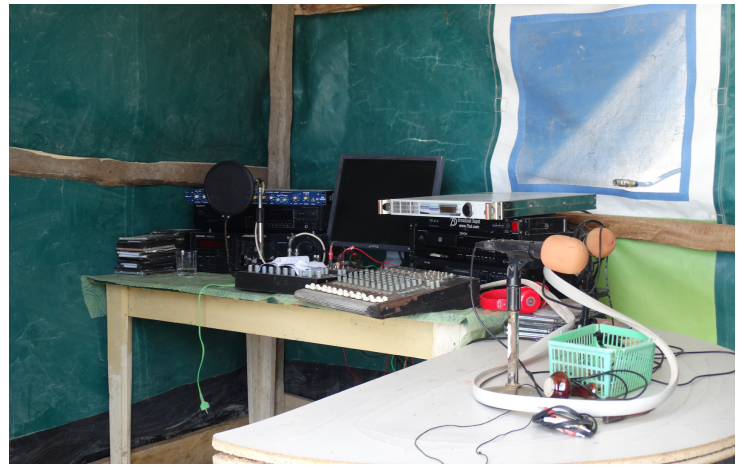
Figure 4 - Broadcasting from a tent

However, even while facing adversity, many of the owners have sought to get their media back on air to serve their community. Just one day after the storm, they were drying their equipment in the sun (Fig 5) and constructing alternative antennas. Others, who lost the building where their radio station was hosted, built up tents with tarps to broadcast again (Fig 4).