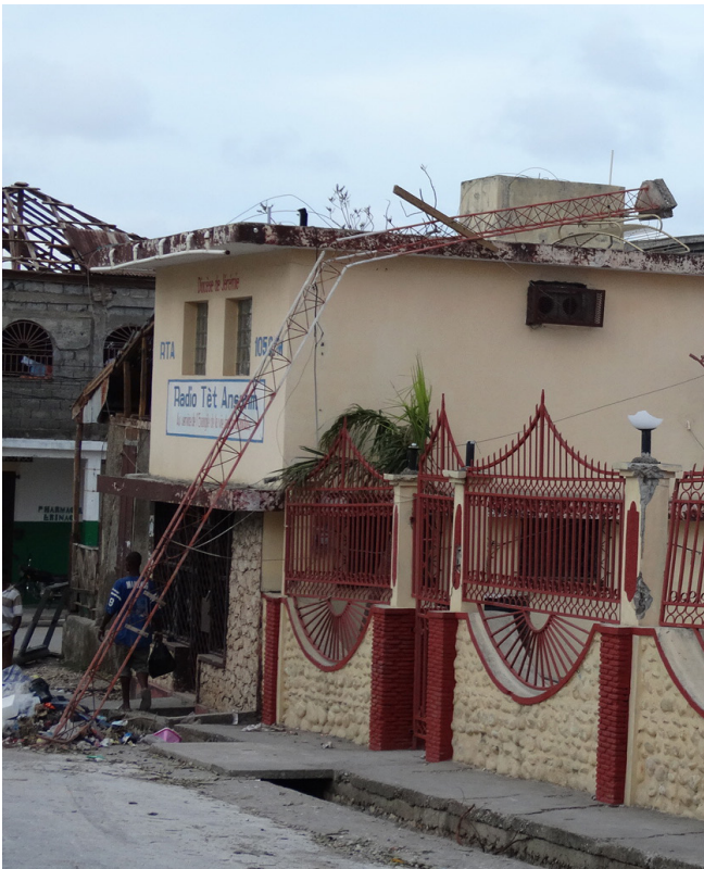
Figure 2 - Toppled antenna

On October 7th, Internews sent out a team with a radio & telecom engineer to do a full technical assessment of the radio & TV stations in the affected areas. In difficult circumstances, with roads being blocked and bridges been washed away, the team managed to assess directly 52 media outlets and remotely cross check information about damages to 18 others. Beyond those 70 stations, Internews assessed damage to three of the main private radio & TV broadcasters based in Port au Prince who have extensive coverage across the country. All of which have sustained damage to some of their relays, partially impacting their ability to reach the entire affected population.