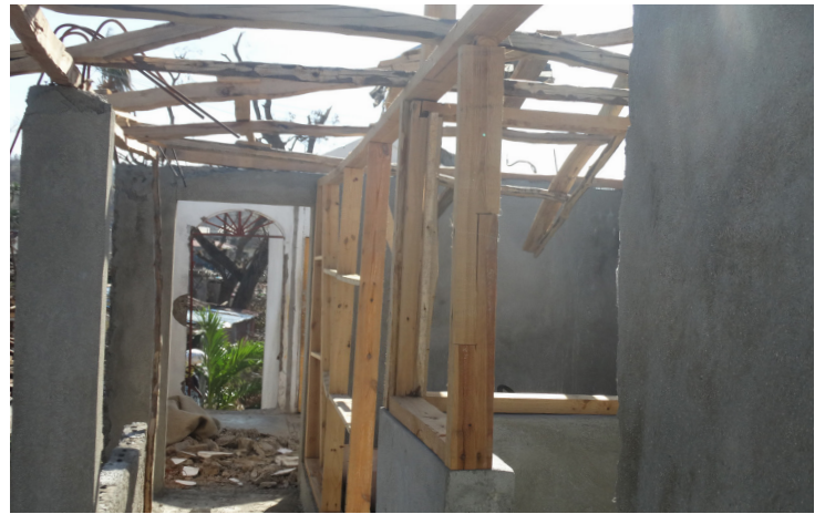
Figure 6 - Severely damaged studio