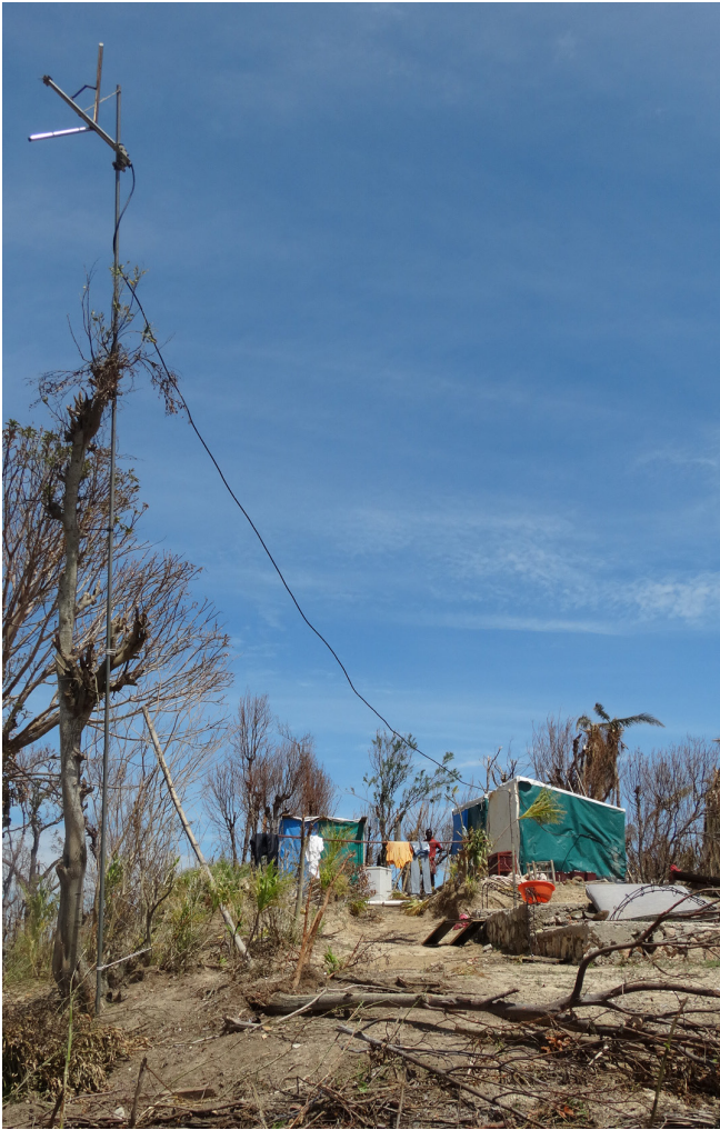
Figure 3 - Makeshift Antenna and studio.