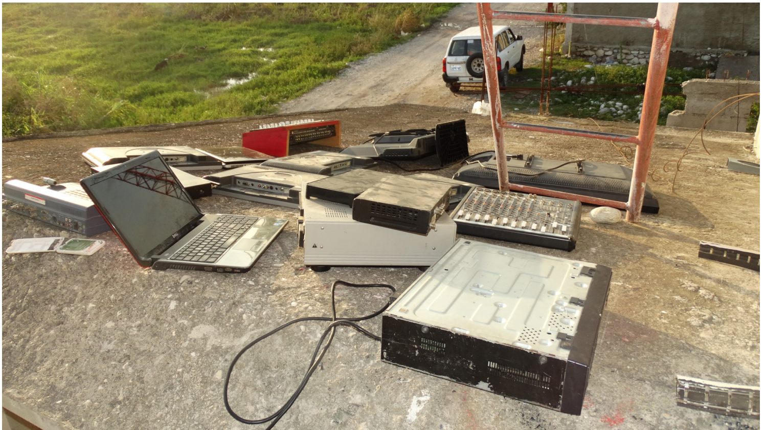
Figure 5 - Drying equipment