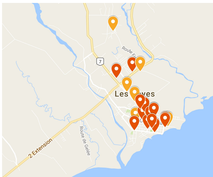
Figure 7 - Stations damages in Les Cayes