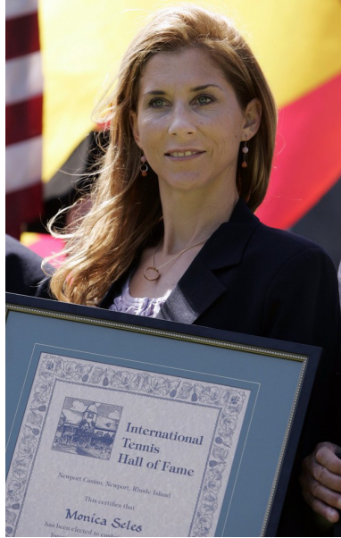
Monica's induction into the Tennis Hall of Fame