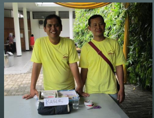
As a cashier at a YUM Charity Garage Sale