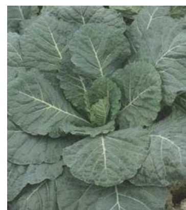
Georgia Southern-type Collard

On the smaller, kitchen-garden scale, many common pests such as bean beetles, cabbage worms, and squash bugs can be controlled by hand-picking. Control is not 100% but can often be sufficient to produce a good, viable food crop.