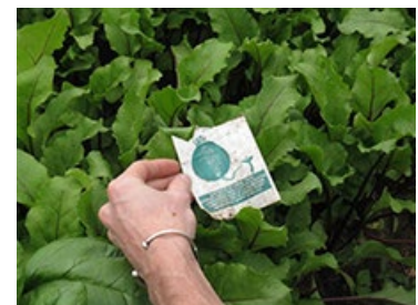
Beet A, North Korea

Nutritional information printed in italics throughout is paraphrased from the George Mateljan Foundation website (whfoods.com) and other sources. Please consult your own sources of nutrition expertise to supplement the ideas provided in this text.