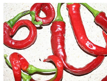
Hot Pepper A is Variable in Shape