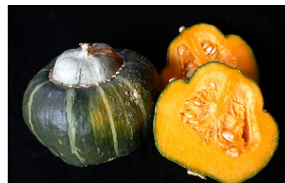
Typical Buttercup-type squash

Folic Acid (folate) is a B vitamin that prevents birth defects. Folate works by supporting red blood cell circulation and the nervous system. Low levels are also associated with cognitive impairment in children, and early dementia in adults.