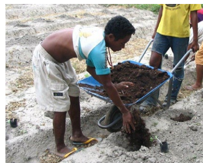
Soil improvement can be essential.

Watermelon A. Hybrid, orange-flesh watermelon, large oblong fruits. Well-received and reordered in both Liberia and by two programs in Nicaragua. Consult locally as to whether orange flesh will be an issue. If not, this is a proven variety in our experience.