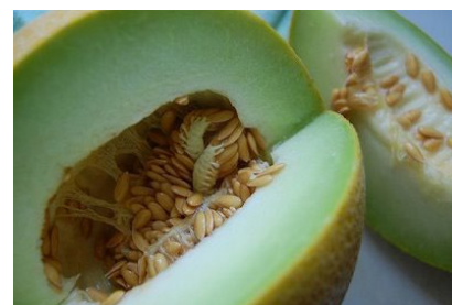
Galia Melon, typical appearance.

Vitamin K is a family of substances. It is essential for bloodclotting and as a result is indicated to prevent easy bruising, gum bleeding, and inflammation. Bone density loss and breakage can be caused by Vitamin K deficiency. The top sources are all green vegetables.