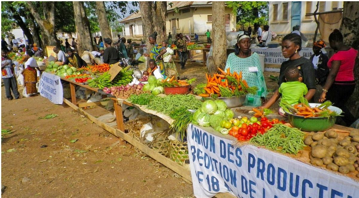
Results from SPI seed, with other produce. Central African Republic, 2011. Partners: Assomesca, Child First Meds.