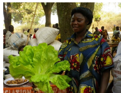
Lettuce can be grown in tropical places if watering is steady.

Some of our partners look beyond feeding the household to providing seed for small farming businesses. In addition to vegetables, SPI offers a couple of types of flower seed for microenterprise use.