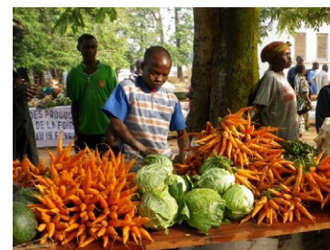
Carrot A, Central African Republic

On the smaller, kitchen-garden scale, many common pests such as bean beetles, cabbage worms, and squash bugs can be controlled by hand-picking. Control is not 100% but can often be sufficient to produce a good, viable food crop.