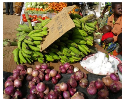
Onion B, Central African Republic

Why don't you say the variety names? Our seed is donated to us in bulk by some of the small and large seed producers who supply farmers and gardeners worldwide. We are able to receive these donations of good, tested, bulk seed by promising donor and variety name anonymity.