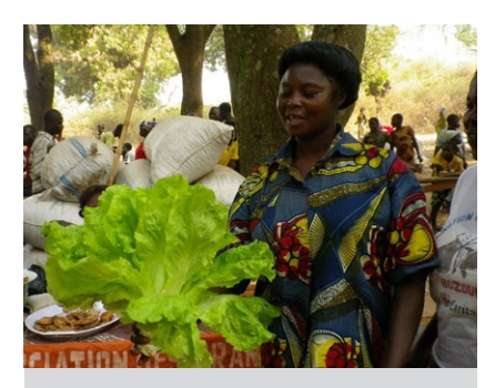
Lettuce can be grown in tropical places if watering is steady.

Some of our partners look beyond feeding the household to providing seed for small farming businesses. In addition to vegetables, SPI offers a couple of types of flower seed for microenterprise use.