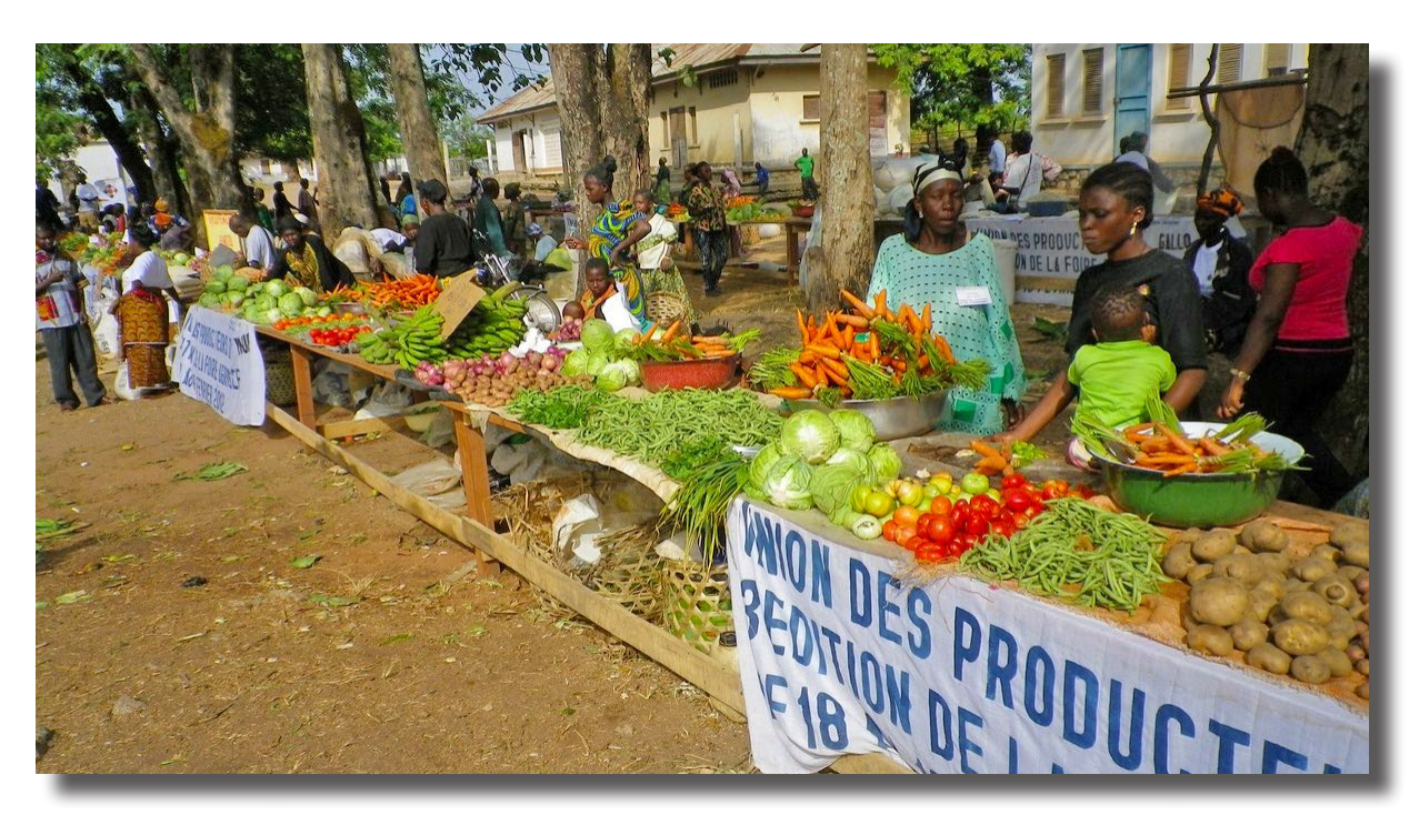
Results from SPI seed, with other produce. Central African Republic, 2011. Partners: Assomesca, Child First Meds.