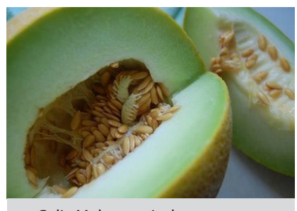
Galia Melon, typical appearance.

Vitamin K is a family of substances. It is essential for bloodclotting and as a result is indicated to prevent easy bruising, gum bleeding, and inflammation. Bone density loss and breakage can be caused by Vitamin K deficiency. The top sources are all green vegetables.