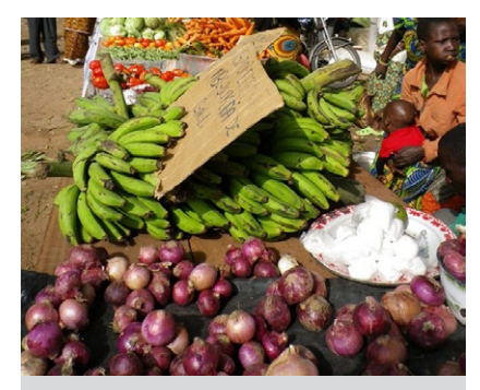
Onion B, Central African Republic

Why don't you say the variety names? Our seed is donated to us in bulk by some of the small and large seed producers who supply farmers and gardeners worldwide. We are able to receive these donations of good, tested, bulk seed by promising donor and variety name anonymity.