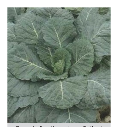
Georgia Southern-type Collard

On the smaller, kitchengarden scale, many common pests such as bean beetles, cabbage worms, and squash bugs can be controlled by hand-picking. Control is not 100% but can often be sufficient to produce a good, viable food crop.