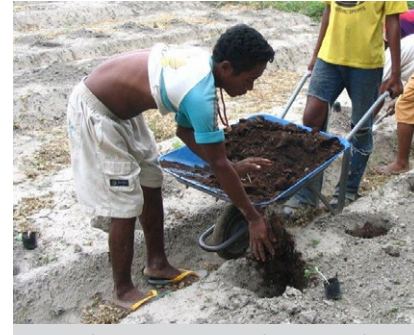
Soil improvement can be essential.

<u>Watermelon A</u>. Hybrid, orange-flesh watermelon, large oblong fruits. Well-received and reordered in both Liberia and by two programs in Nicaragua. Consult locally as to whether orange flesh will be an issue. If not, this is a proven variety in our experience.