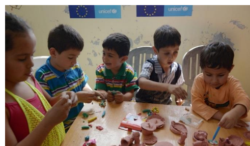
Play encourages cooperation and strengthens children's capabilities. At the Risala Scout Centre in Lebanon, children play with clay trying to make pottery. The NGO Terre des Hommes hosts EU funded PSS activities at the centre.

The Lebanese Paediatric Society, in collaboration with the MoPH, WHO, and UNICEF hosted a polio information session in Beirut on 9 September. The session included a review of the regional situation by the UNICEF and WHO colleagues focusing on reaching missed