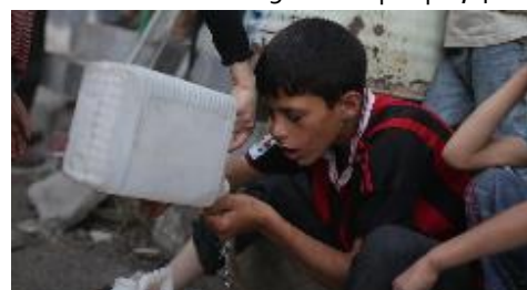
A boy drinks the remaining water in his jerrycan while waiting in a queue for safe water. Douma, East Ghouta, Rural Damascus, about 10 kilometres from Damascus.

Additionally, in the reporting period 198,350 IDPs and host communities, including those living across lines of conflict, benefited from access to safe water through water trucking, provision of aqua tabs and water tanks. In Talbiseh and surrounding villages in Homs, where the population relies on untreated water from wells, UNICEF and the Syrian Arab Red Crescent (SARC) distributed water purification tablets to enable 76,350 people to treat water in their households. In eastern Aleppo City and Rural Aleppo, UNICEF delivered 40 water tanks (70 cubic meters each) to enhance the water storage capacity, benefiting around 52,500 people. Daily water trucking supports 61,000 IDPs and host communities in Aleppo city. A further five water tanks (45 cubic meters each) were delivered in Idlib for 4,500 people when installation is completed.