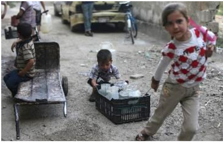
In Douma, East Ghouta, Rural Damascus, current water availability is just 40 per cent of the pre-war level. Douma is hosting a large number of internally displaced families and has been under a tight blockade for almost a year