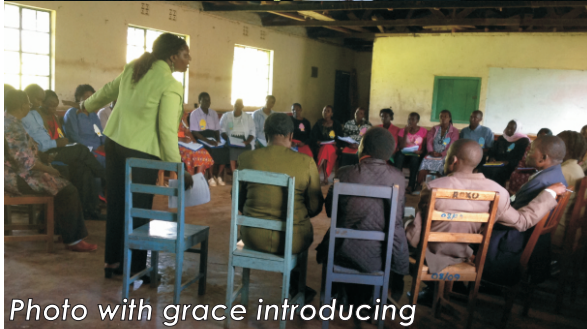
Photo with grace introducing