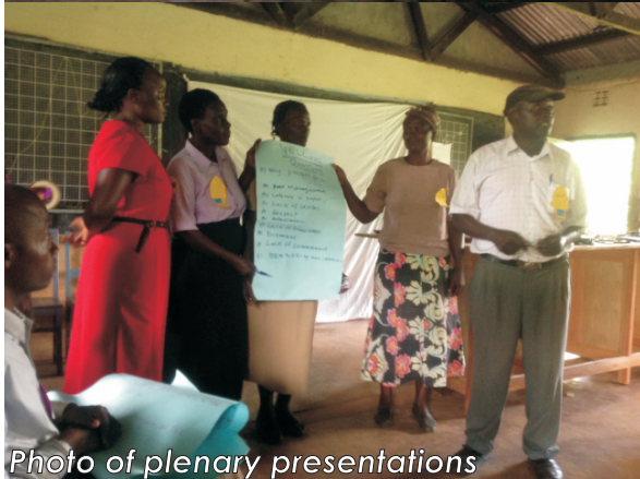
Photo of plenary presentations

an opportunity to reprimand the parents for doing FGM underground since the legal ban. At the same time it revealed how police were so corrupt that they were unable to stamp out FGM. All these unfolded in front of the deputy commissioner of police. Very serious messages were passed on amidst laughter. By the end of the day some people began telling the organizers of the event to keep doing this to stop harming our girls.