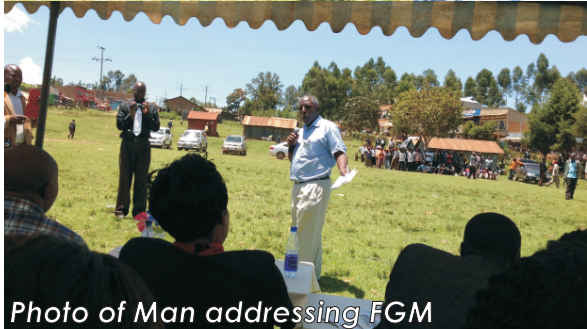
Photo of Man addressing FGM