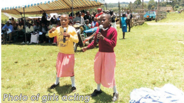
Photo of girls acting