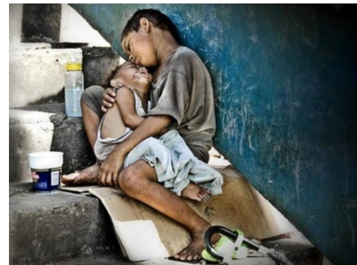
Street children in Chitwan