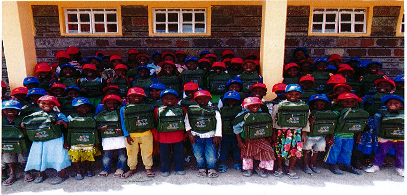
Children with their Christmas presents- school bags and caps