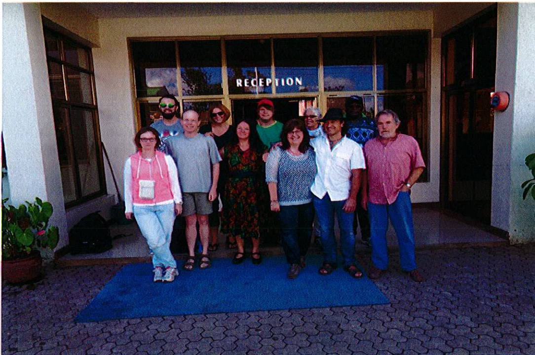
A photo of sponsors who visited this year

The sponsors for the NGO visited the country field projects between 30 th October and 8 th November, 2015. During the visit the group participated in a number of community activities including sports, micro-credit projects, home visits and community outreach.