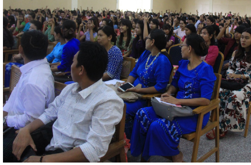
Students and staff at eTekkatho training at Dagon University August 2018