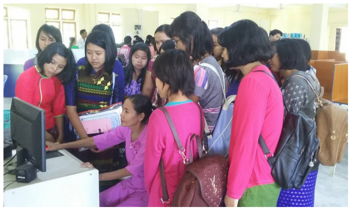
Students learning to use eTekkatho at Taungoo University