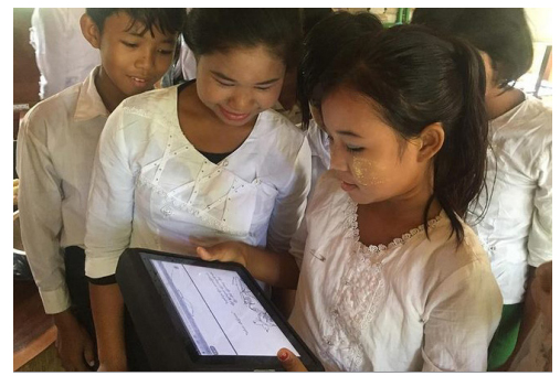
Students at Mingun School learning to use the new MyLibrary July 2018

During the reporting period, we are pleased to report that, with the support from Omidyar Network, we have restuctured the eTekkatho programme to make it more scalable.