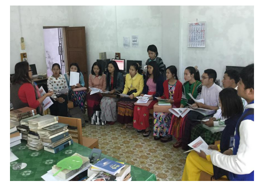
Group eTekkatho training session at Myitkyina University March 2018