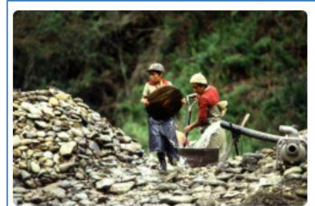
Poverty leading to child labor in Nepal

“Child labor, child trafficking and even child marriages on the rise due to pandemic induced poverty. Based on the national data of Nepal’s Central Bureau of Statistics for 2021, among the 7 million children between the age of 5 and 17 in Nepal, 1.1 million (15.3%) children are subjected to child labor.” [https://www.nepalnews.com/s/issues/poverty-leading-to-child-labor-in-nepal]