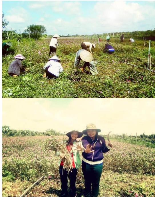
Growing herbal medicine garden in An Giang (round 3, 2016)