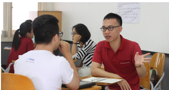
2017-2018 cohort in discussion