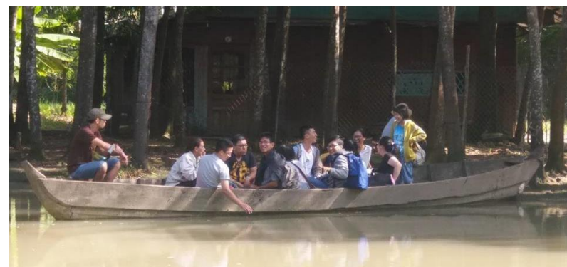
Teambuilding activities for the 2017-2018 cohort