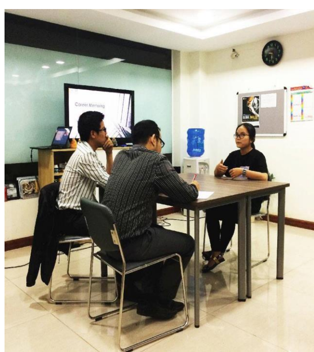
JAS project - Training sessions of job-searching skills for disadvantaged students in HCMC and Universities Village (round

113 grants provided to humanitarian and community development projects (addressing various issues in education, environment, inequality, disabilities, health care, etc.) benefited over 70,000 people in Southern Vietnam. Watch this video for Narrow The Gap introduction.