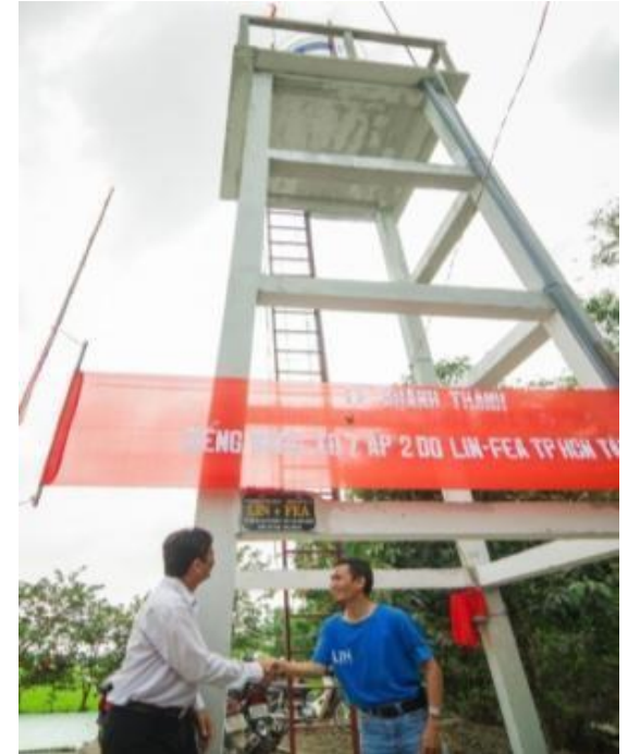
Clean Water Tower, one of the projects focused on Community Development (round 2, 2016)