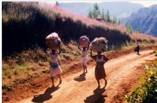
Road to democracy