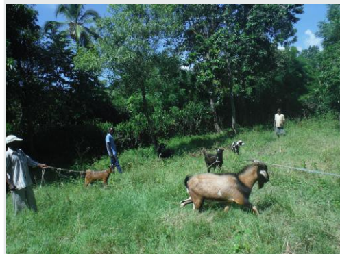
Goat breeding increases income

At this juncture we will soon be expanding our Board, so if you or someone you know has a passion for bottom up development in Haiti and a desire to fundraise in the USA, let us know!