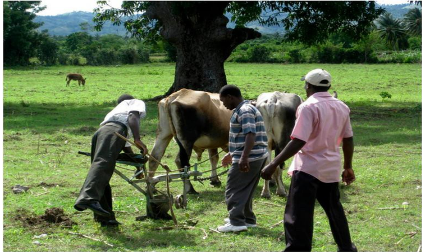
Ox plowing service