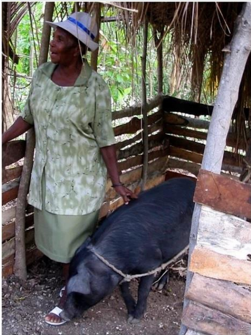
Pigs are a sign of prosperity