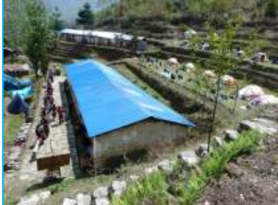
PHOTOS: TOP: PHUL MAYA, MIDWIFE AT TIPLING CLINIC WITH MOTHER & CHILD RT.: PHUL MAYA MAKING HOME VISITS 2 ND ROW LEFT: ARTHRITIS PATIENT AT HEALTH POST RT.: PHE DORJE, HEALTH PROVIDER AND SUPERVISOR USING ULTRASOUND MACHINE ON PREGNANT WOMAN AT TIPLING CLINIC 3 RD ROW LEFT: PHE DORJE CARRYING OUT LAB INVESTIGATIONS (ROBERT STERN) 3 RD ROW RIGHT: PATIENT CARRIED IN BY SON BOTTOM LEFT.: PEMA TAMANG, HEALTH PROVIDER AT SHERTHUNG VILLAGE PROVIDING CONTRACEPTIVE RT.: TIPLING VILLAGE HEALTH POST \ CLINIC (PHOTO LOUIS DECARLO)