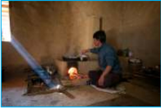
PHOTOS: TOP: WOMAN CARRYING FIREWOOD (ROBERT STERN) MIDDLE: LADY OF THE HOUSE WITH BOTH OLD AND NEW WOODSTOVES IN THE BACKGROUND BOTTOM: HHC FUNDED EFFICIENT WOODSTOVE (ROBERT STERN)