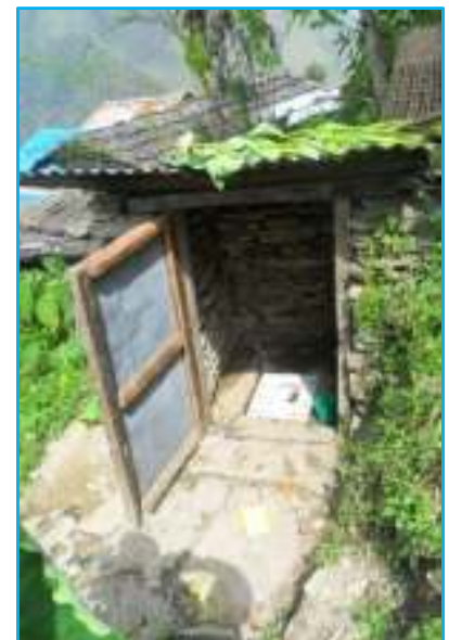
PHOTO: HHC FUNDED TOILET AT THE BACK OF A HOUSE IN TIPLING VILLAGE