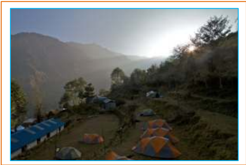
TIPLING VILLAGE MEDICAL CAMPSITE, WITH THE HIGH PASS RIDGE IN THE FAR SUNRISE HORIZON

The aftermath of the civil war, with its political uncertainty, weak governance and economic drudgery, continues to make life difficult for the Nepali people. The operating premise of HHC is to help villagers to become self-reliant by addressing their basic healthcare, education and income-generation deficiencies. We hope to give the villagers a foundation for a prosperous future independent of our assistance. HHC exists to provide care, hope and opportunity to the rural people of Nepal.